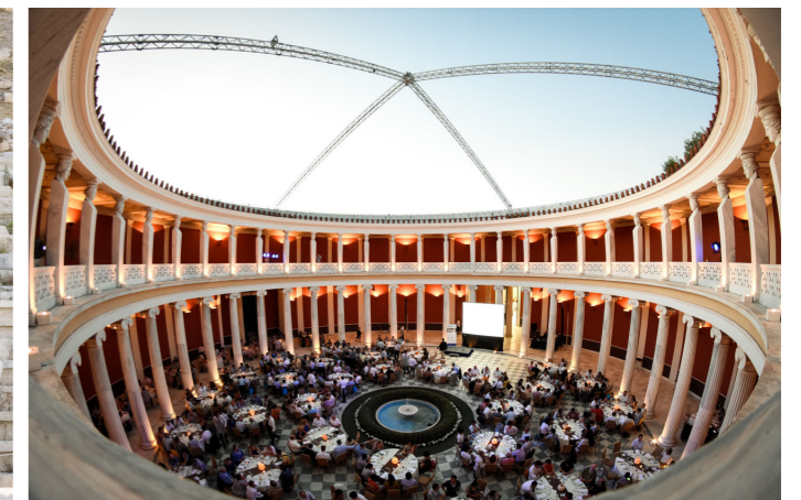
Banquet Dinner at Zapeion Megaron.