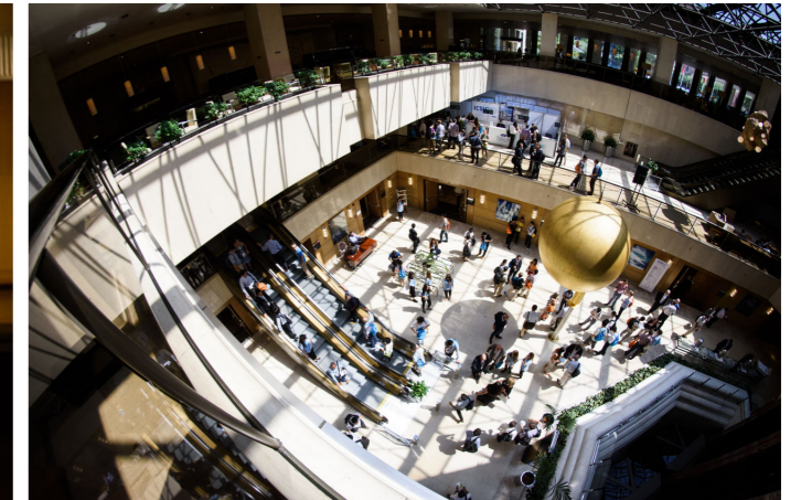
View of Athenaeum Intercontinental — Coffee Area.