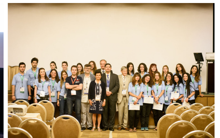
IIAVs Past, Present and Elect Presidents, the ICSV23 General Chair and ICSV23 staff.