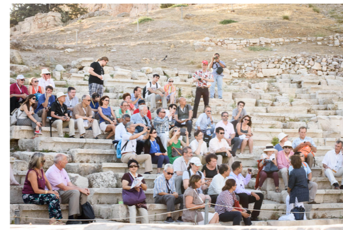
IIAV Members Special Event Guided Tour to Theater of Dionysus at the downhill of Acropolis.