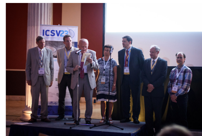
IIAVs Past, Present, Elect Presidents and Officers at ICSV23 Banquet Dinner.